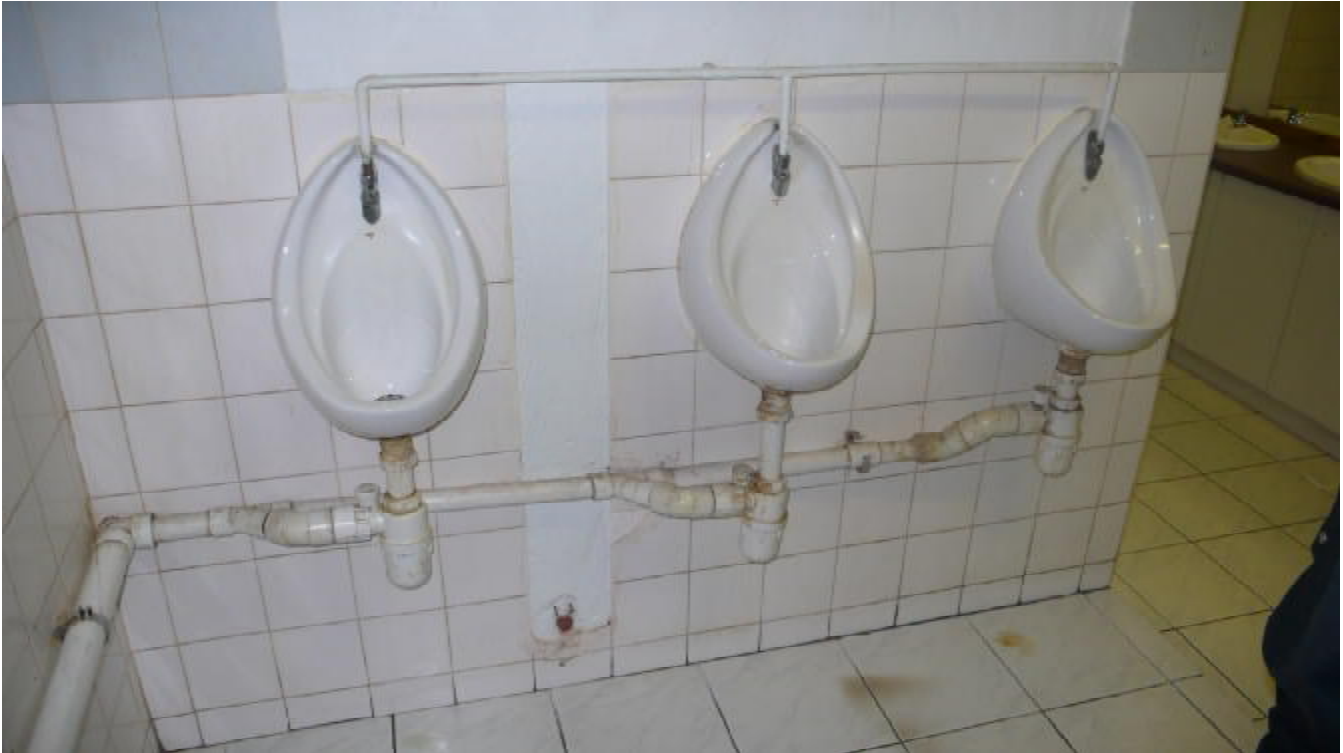
above: Installation before upgrading below: beginning to remove piping.