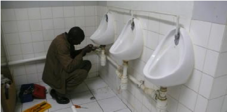
below: Deposit smelling terribly for eternity!